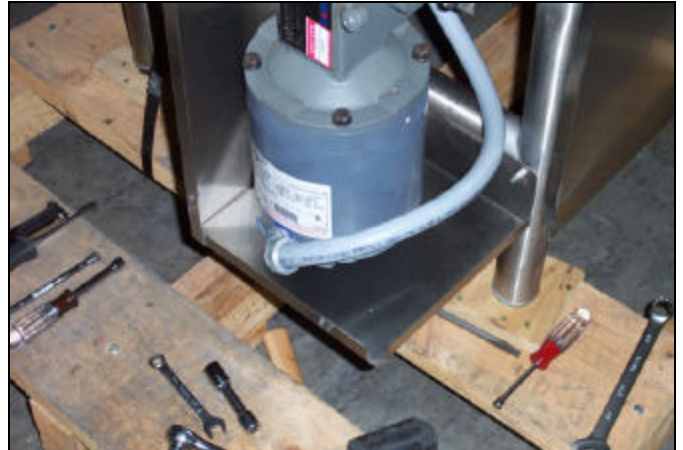
The WRONG way to mount the drive motor.